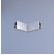
40077.1 Angle joint 90° Hush