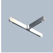
40079.1 T joint Hush