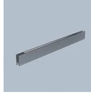
40078.1 Linear joint Hush