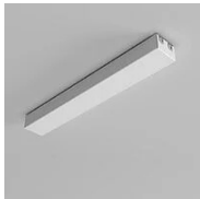
40122 Canopy with power supply Hush