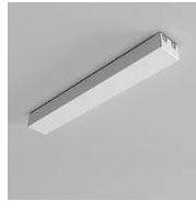
40121 Canopy with power supply Hush