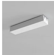
40119 Canopy with power supply Hush