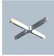
40080.1 Cross joint Hush